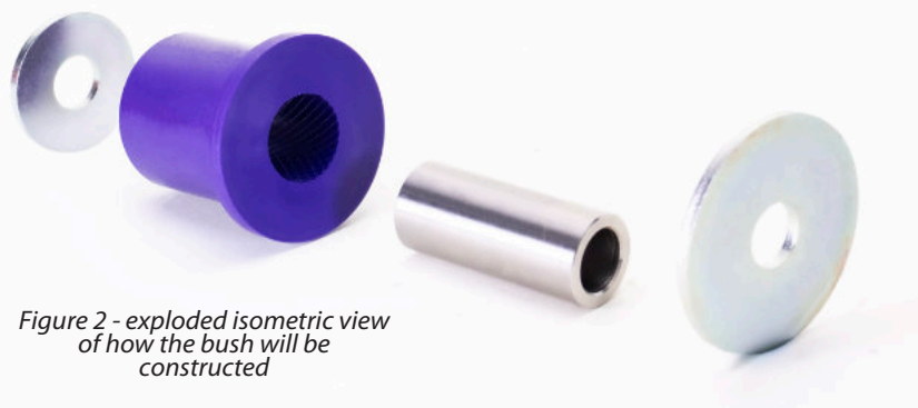
Figure 2 - exploded isometric view of how the bush will be constructed